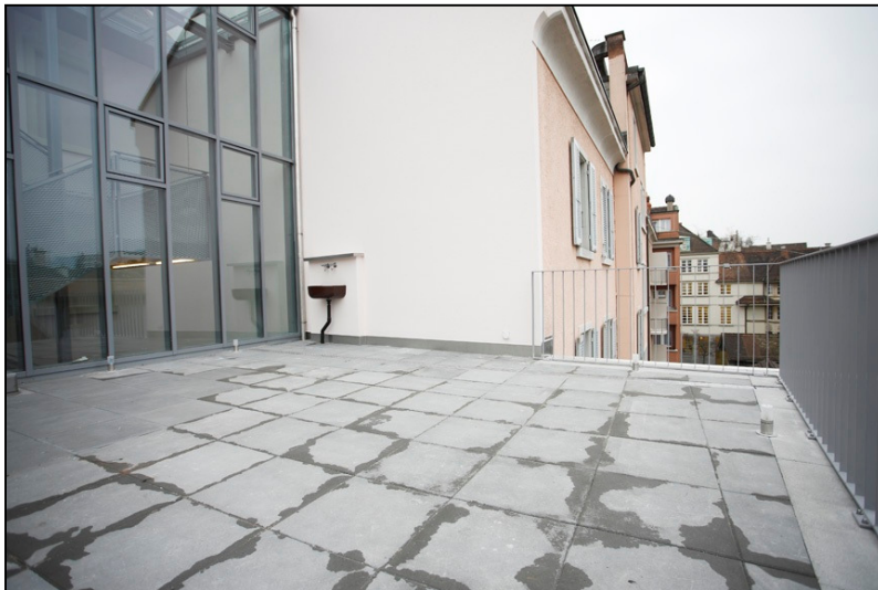
View from your exclusive 36m 2 terrace (over a secluded quiet courtyard). Note glass/steel stairway – a great designer feature for the building

The apartment also has a sunny 36m 2 SW-facing terrace for your exclusive use, which is large for Zürich. Even though you might wish to take the designer steel and glass staircase to your 3 rd floor, you could just take the elevator straight into your apartment, which works via exclusive key access and also protected by security video/phone entrance. Only your key operates the elevator to the 3 rd floor. The apartment occupies the whole 3 rd floor, has high ceilings (>2.5m) and is designated 2½ rooms, with double bedroom, living room including fully fitted kitchen area and entrance hall. A separate bathroom also houses your Miele washer/dryer for laundry. A lockable private cellar and communal drying room are also available on the ground floor. Servicing of the apartment can be arranged depending on your requirements.