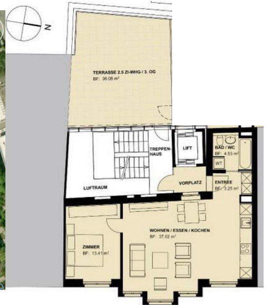
Zähringerstrasse (#27 half-way down on the right)